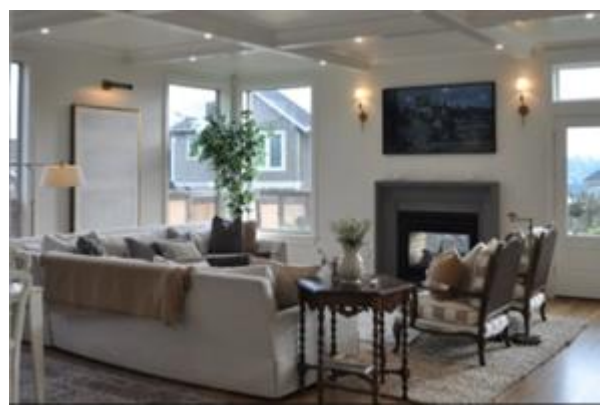
Can you find the sprinkler heads?